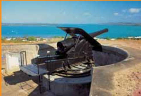
Gun, Greenhill Fort.