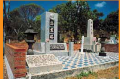
Japanese Pearl Divers Memorial