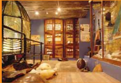
Torres Strait Museum - Greenhill Fort, Thursday Island.