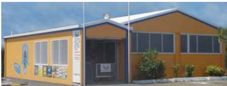
Peddell's Jetty Shop Thursday Island